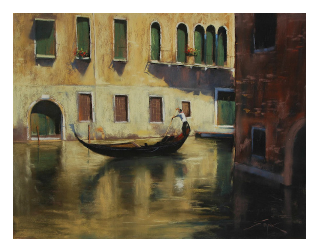
These Drawings are by Gabor Svagrik