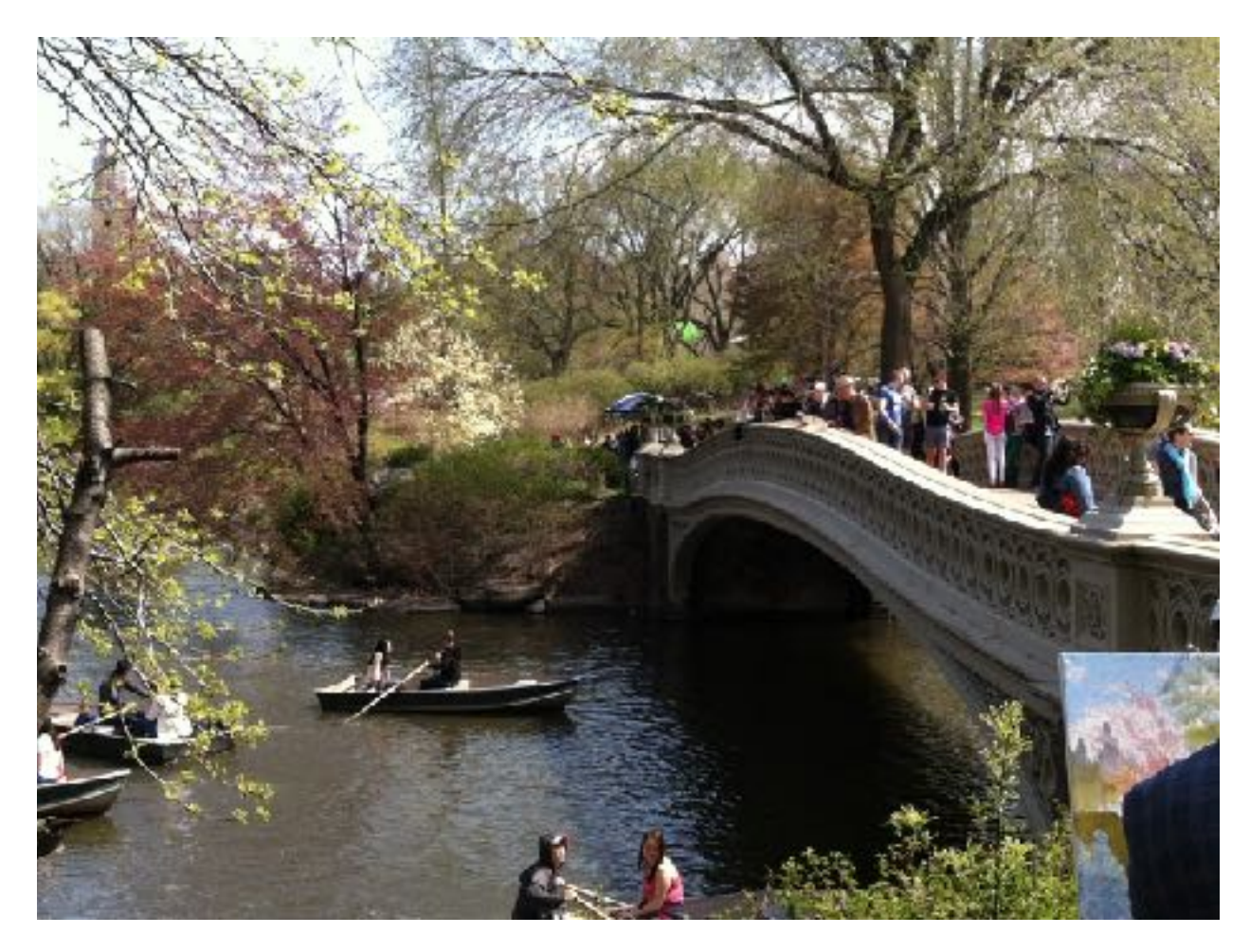
Example 1 - A form shadow on the bridge caused by light.